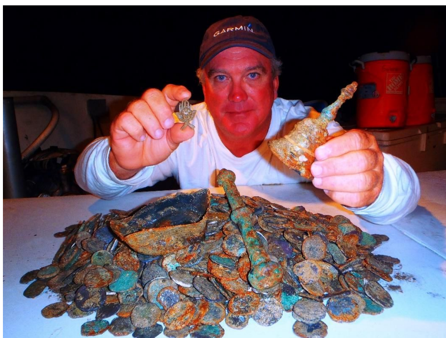
Initial discovery of the second area of the San Jose.