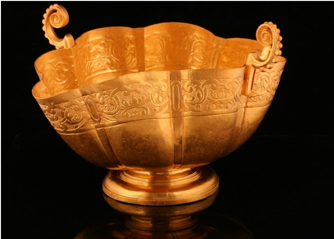
Gold chalice recovered in 2008.

Dan Porter and daughter Allie Porter with the gold chalice recovered in 2008.