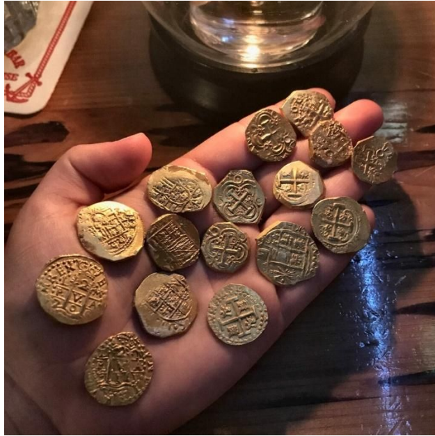
Some of the gold two escudos recovered by MRR in 2017.

In 2018, MRR recovered four gold coins, a gold ring and thirteen silver coins along with many other artifacts.