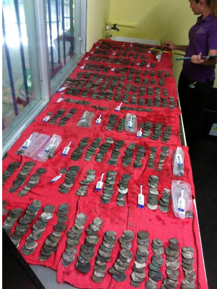
INAC inspector reviewing a day's recoveries.