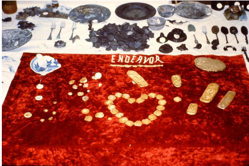
Recoveries made by the Endeavor during the 1983 season.