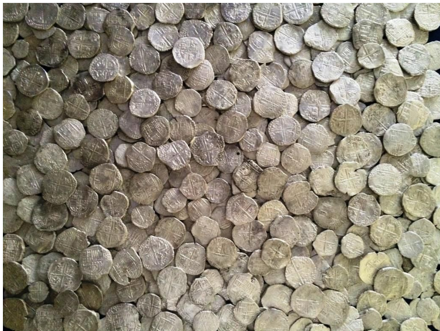
Single excavation of coin recoveries, photographed after conservation.