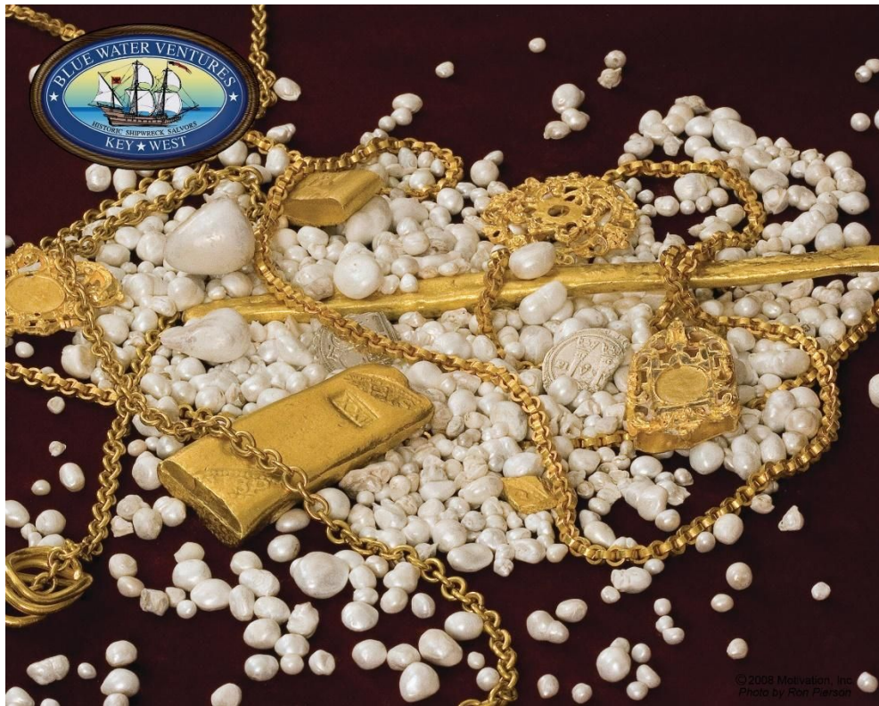
Gold bar, chains, jewelry, silver coins and pearls recovered during the 2007 season.