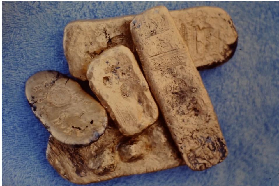
Gold bars recovered by the Endeavor during the 1983 season.