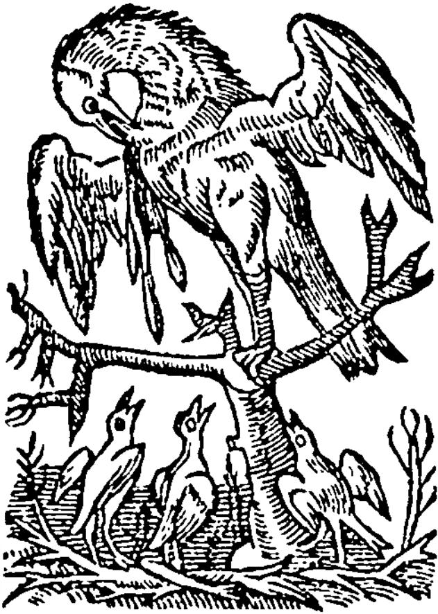
The bird in "pelican in her piety" imagery often looked nothing like a pelican, resembling more a cross between an eagle and a phoenix.

The Perfect Day crew members in turn have their own contracts to determine who gets how much. That