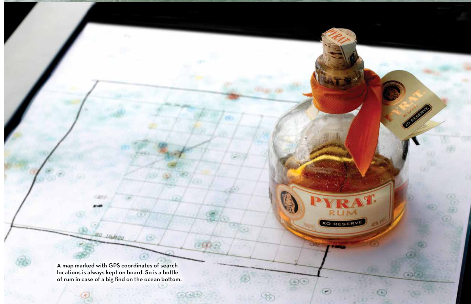
A map marked with GPS coordinates of search locations is always kept on board. So is a bottle of rum in case of a big find on the ocean bottom.