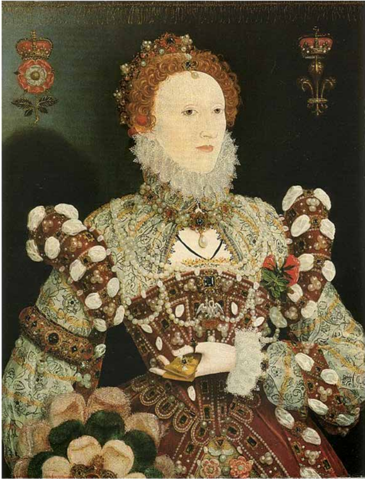
Queen Elizabeth I wears a "pelican in her piety" pendant, circa 1573.

Of course, the big question after finding something like the 1715 Wing is: What will be done with it? The pro-