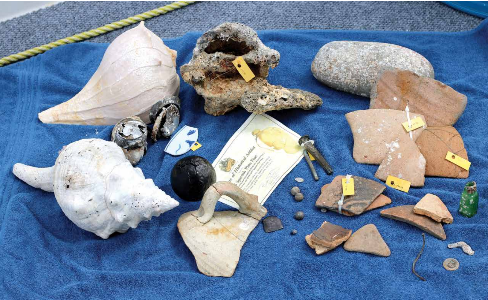
It’s not all silver and gold. There are many other interesting artifacts to be discovered while treasure hunting. This spread displays some of the finds the Perfect Day crew has held on to, including the inevitable beer cans and seashells. The encrusted object at top center is a Spanish sword hilt.

crews that head out in their boats each summer to search for sunken Spanish treasure. They all do it as subcontractors for 1715 Fleet-Queens Jewels LLC, which owns the exclusive salvage rights to the wrecks through the U.S. District Admiralty Court and under permanent contract with the state of Florida. “The estimate is that, between all the wrecks, $400 to $500 million is still missing in gold and silver and jewelry,” Jones says. “There are four ships that have never been found.” That optimistic appraisal is what keeps everyone motivated, although the reality is that many of the dives are uneventful. “We find a lot of beer cans,” Newman says. “We bring up everything, and we usually have a trash can full by the end of the week – cans, fiberglass, rope, nets, plastic.” On better days, however, they’ll find pottery shards, deck nails, musket balls, cannon balls, antique bottles, pieces of Chinese porcelain, ballast stones, an encrusted