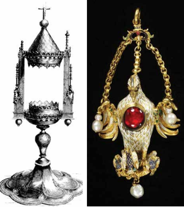
Left: A 16th-century reliquary with its central container missing Right: A 16th-century enameled gold pendant with a three-chain hanging design similar to that of the 1715 Pelican sculpture.

Schubert suspects it was for private devotion, rather than a church piece. "It would be fantastic if you could